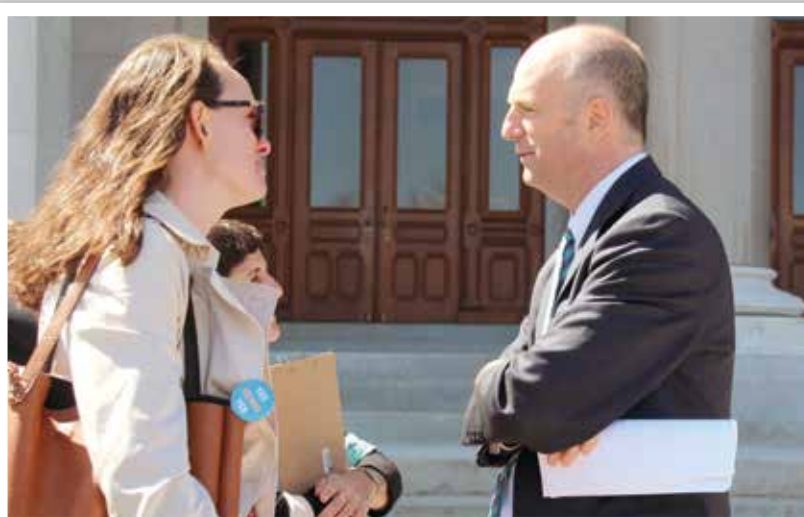
Representative Haddad speaks with advocates at a rally at the Capitol.