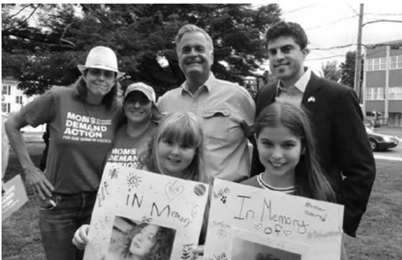
Rep. Meskers with Rep. Blumenthal supporting Moms Demand Action for school security and safety plan.

TEEN VAPING: This was and will continue to be a priority for me. Our children were targeted and became addicted to e-cigarettes and vaping before they knew what hit them. I've co-sponsored legislation that will raise the purchasing age of tobacco and vaping products to 21, and restrict internet purchasing.