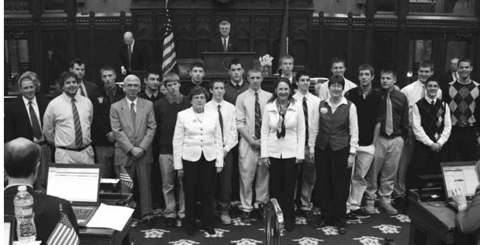
Sheenan High School Boys Basketball Team State Champions being honored in the House Chamber